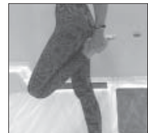
Alternate Quad Stretch

Leg Forward: Balance with one hand on wall; bend outside leg at knee; raise to 90 degrees if comfortable; extend the leg and lower foot to floor.